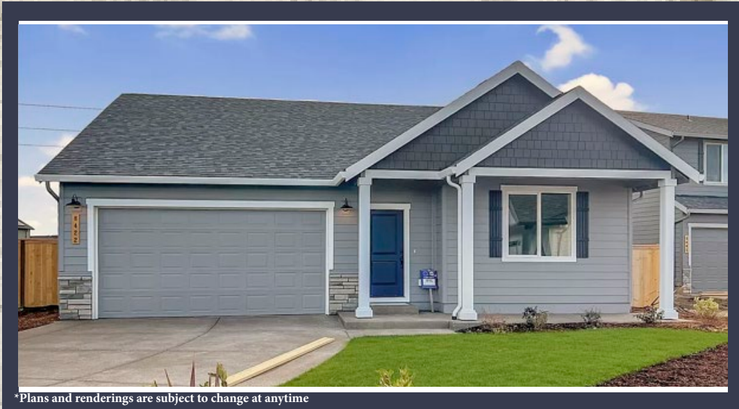
*Plans and renderings are subject to change at anytime