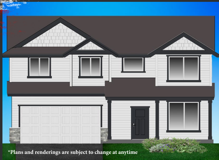
*Plans and renderings are subject to change at anytime

11200 APPLE LN, DONALD, OR 97020 4 BED, 2.5 BATH, 2439 SQFT