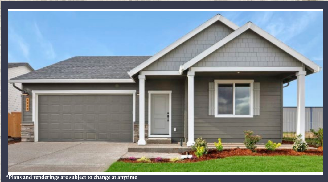
*Plans and renderings are subject to change at anytime