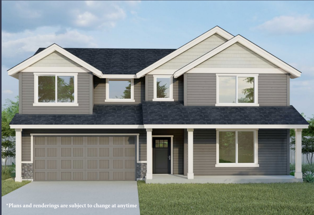
* Plans and renderings are subject to change at anytime